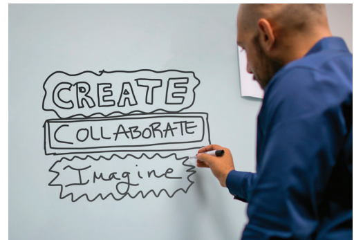
Max™ Glassboard Magnetic