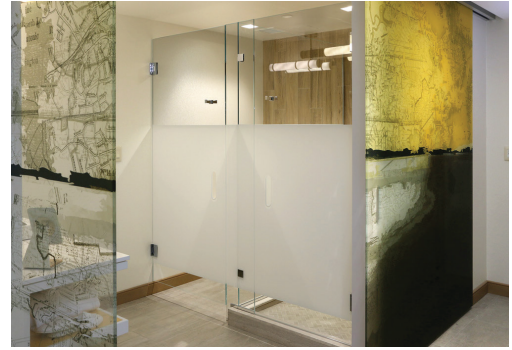
Custom Shower Enclosure + Alice® Design

Satin-Etched - Satin etched glass available in a range of thicknesses and glass types: single and double-sided, clear, low-iron, patterns, mirror and anti-slip flooring options.