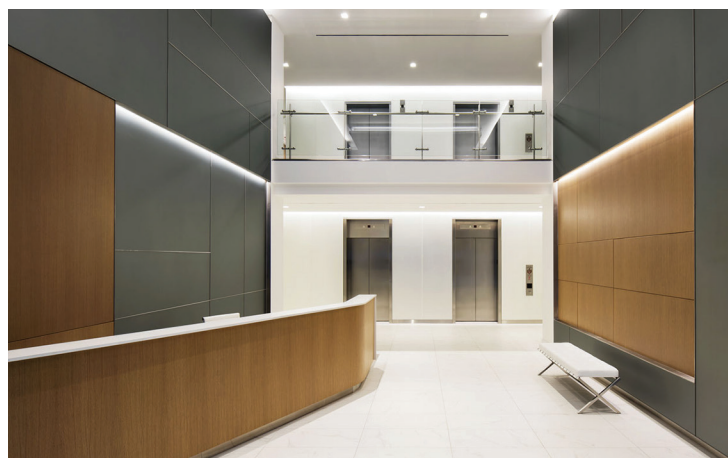
Satin Etched, Low-Iron + Custom Grey Back-Paint